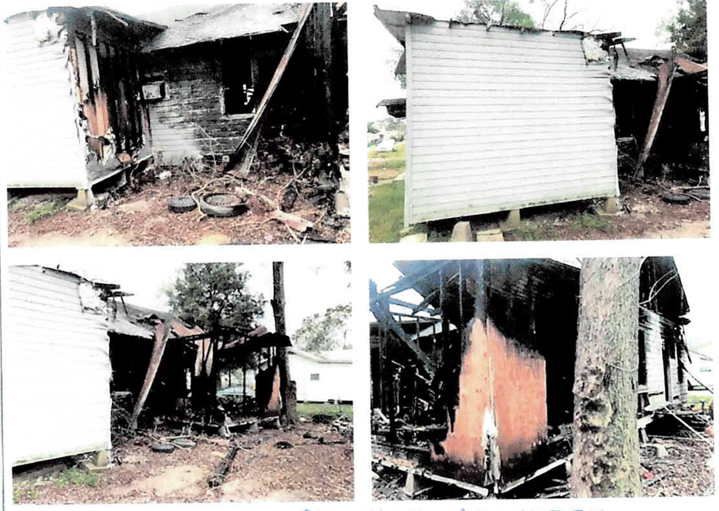
901 EAST LAFAYETTE